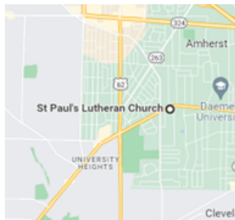
St. Paul's Lutheran Church, Eggertsville