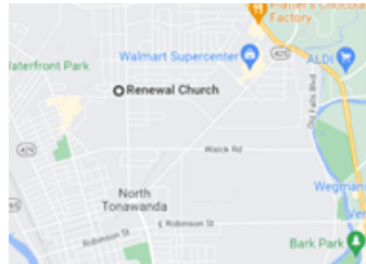
Renewal Church, N Tonawanda